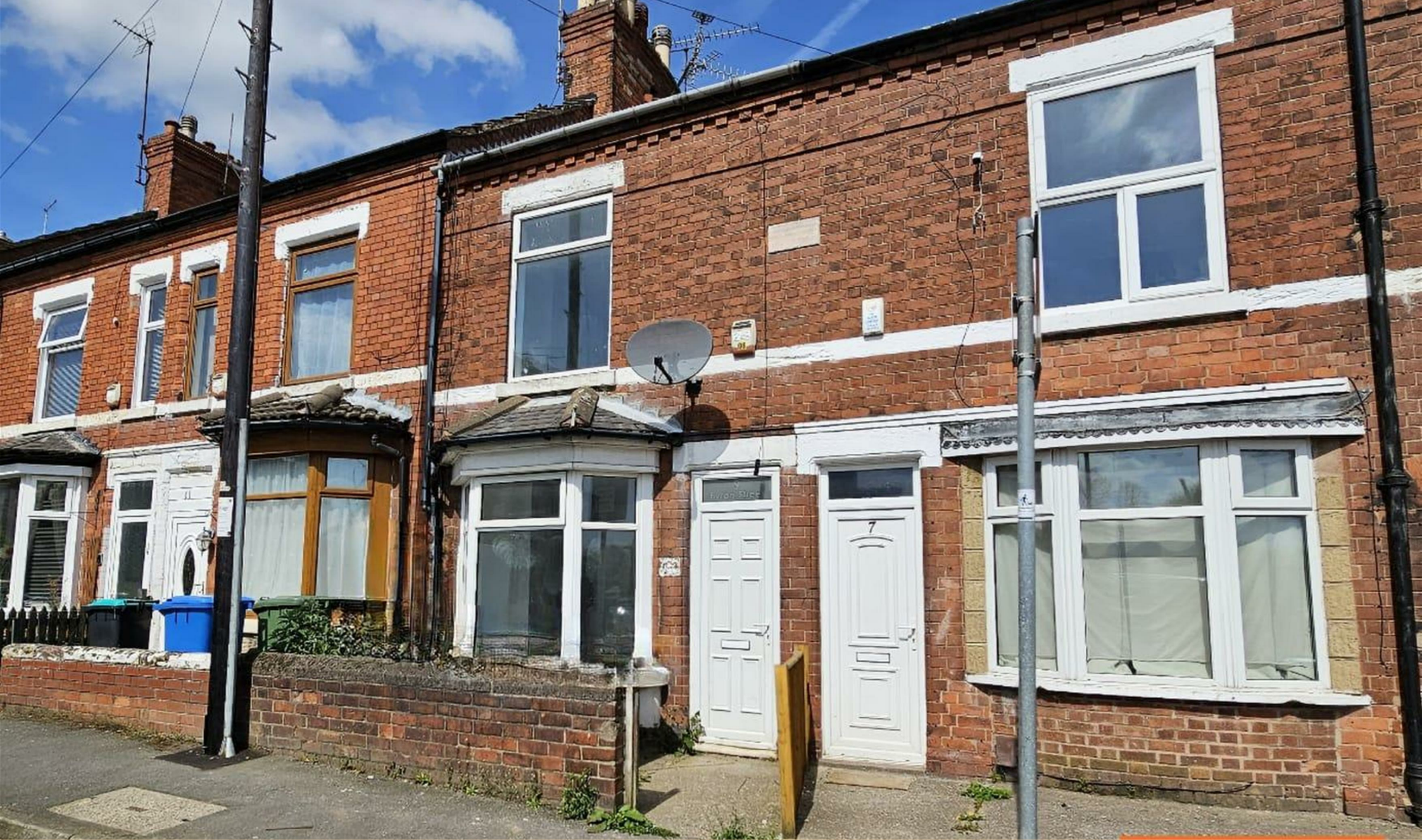
Byron Street, Mansfield, Nottinghamshire, NG18 5NX